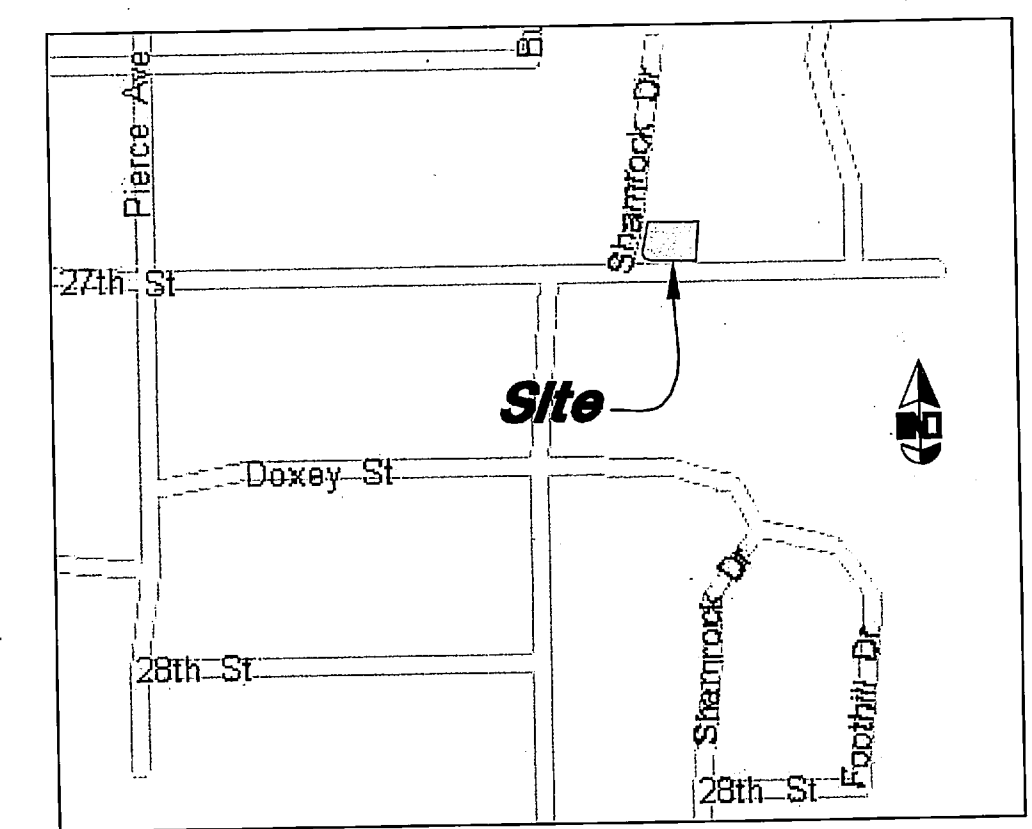
VICINITY MAP Not to Scale