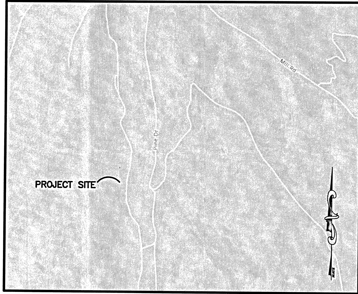
VICINITY MAP SCALE: NONE