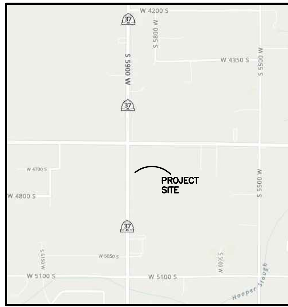
VICINITY MAP SCALE: NONE

WITNESS MONUMENT TO THE WEST QUARTER CORNER OF SECTION 7, TOWNSHIP 5 NORTH, RANGE 2 WEST, SALT LAKE BASE AND MERIDIAN, U.S. SURVEY. FOUND WEBER COUNTY SURVEY MONUMENT DATED "2021"